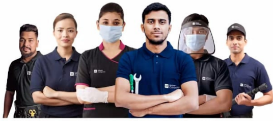
Hair stylists Massage therapists Beauticians Handymen Painters Appliance Technicians

ision: Empower millions of professionals worldwide to deliver services at home like never experienced before