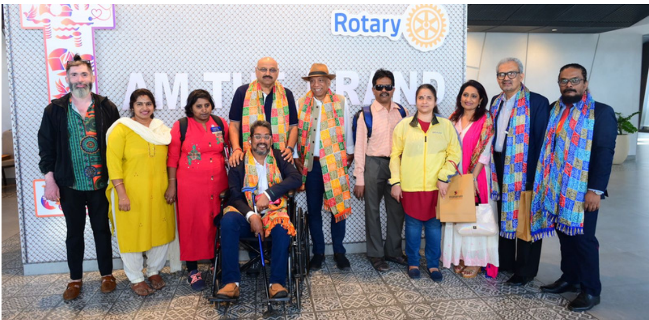
TEAM RBA at Public image ICGF in Bengaluru on 18th Feb 2024

Members of RBA set out on a day long picnic to Aralaguppe, a village in Tumkur district. We 16 of us engaged 3 cars for the picnic. On the way we had a sumptuous breakfast. At Aralaguppe, we were welcomed at Aravind's ancestral home with warmth and welcome drink. After this, we visited 3 temples of historic importance in the vicinity. At each of the temples, members poured out their devotion in the form of songs. The temples had intricate carvings and paintings sculpted many centuries earlier. Then we headed out to the coconut grove, where we relaxed for a while. We feasted on fresh tender coconut juice and pulp. Returning to the ancestral home, we cut a cake (fruit-based). This was to celebrate RBA's Charter Day. We were then served a delicious lunch. After relaxing for a while, it was time to head home. The picnic to Aralaguppe added to the treasure of memories.